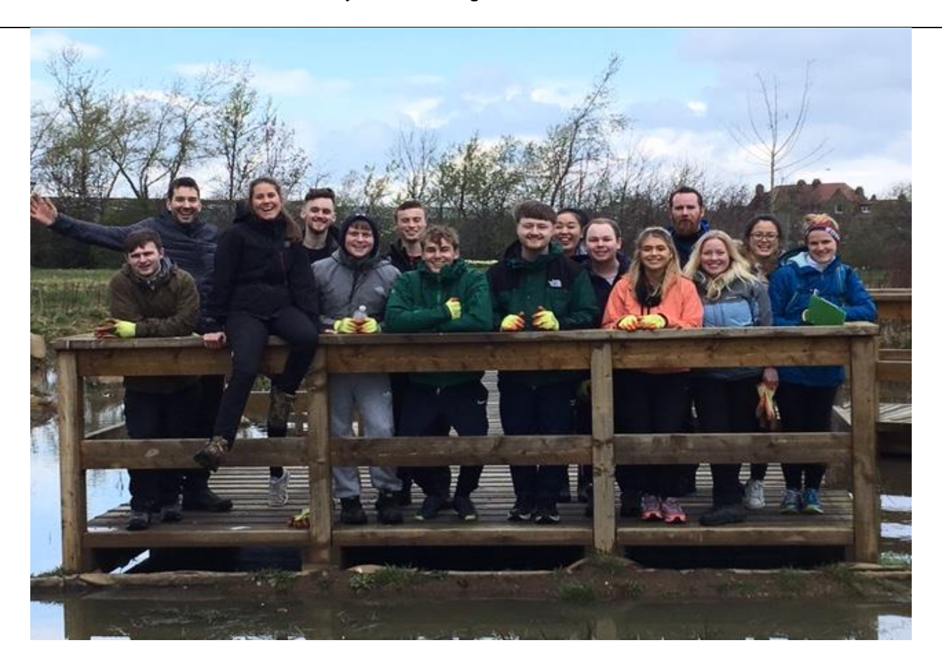
Volunteers following the planting of wetland meadow