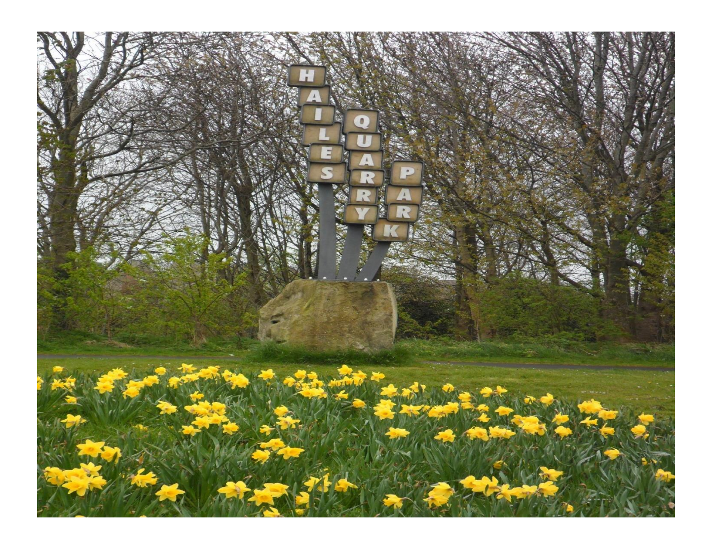
Hailes Quarry Management Plan 2025 – 2030